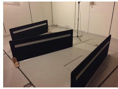
Fig. 1: Measurement setup, ScreenIT A30