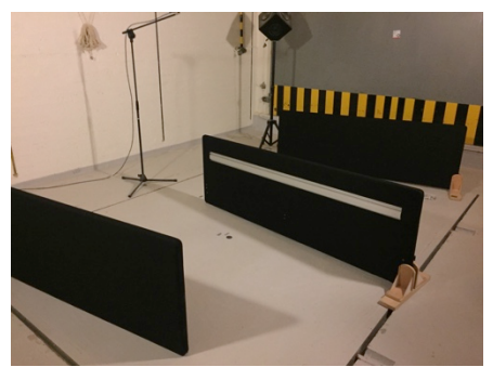
Fig. 2: Measurement setup, ScreenIT A20